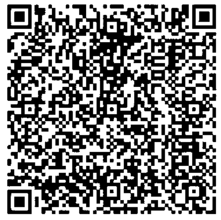
St Mary's Cathedral Main Hall

Note: This method of giving is analogous to putting cash into the offertory bag/box. Your donation will go to the General Fund. You will not be given a receipt. Do not use this to give a pledge.