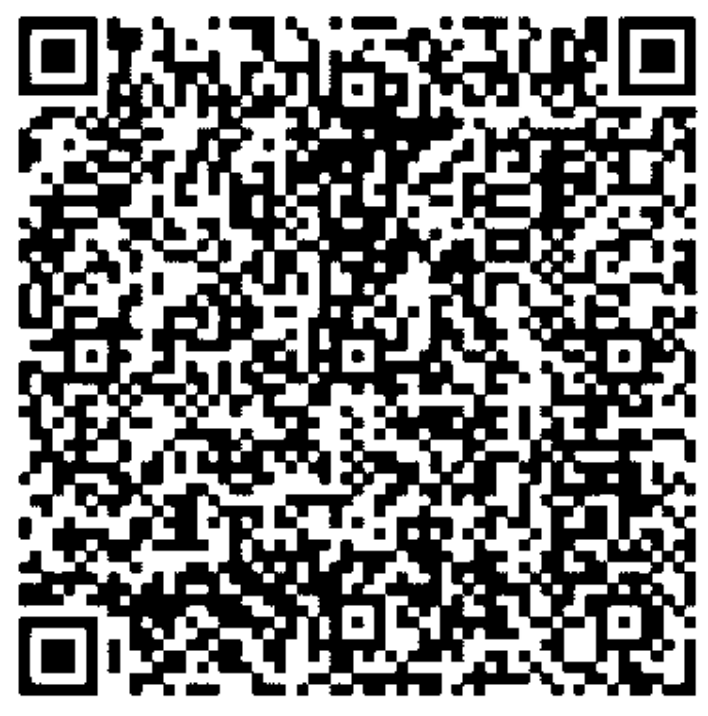
St Mary's Cathedral Main Hall

Note: This method of giving is analogous to putting cash into the offertory bag/box. Your donation will go to the General Fund. You will not be given a receipt. Do not use this to give a pledge.