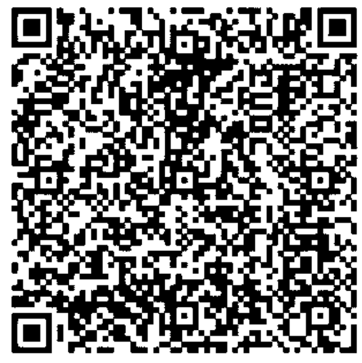
St Mary's Cathedral Main Hall

Note: This method of giving is analogous to putting cash into the offertory bag/box. Your donation will go to the General Fund. You will not be given a receipt. Do not use this to give a pledge.