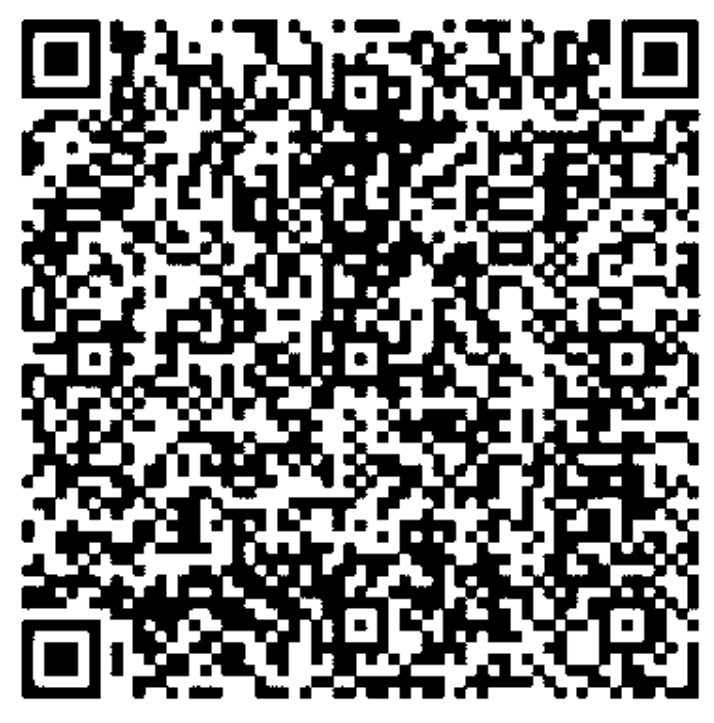
St Mary's Cathedral Main Hall

Note: This method of giving is analogous to putting cash into the offertory bag/box. Your donation will go to the General Fund. You will not be given a receipt. Do not use this to give a pledge.