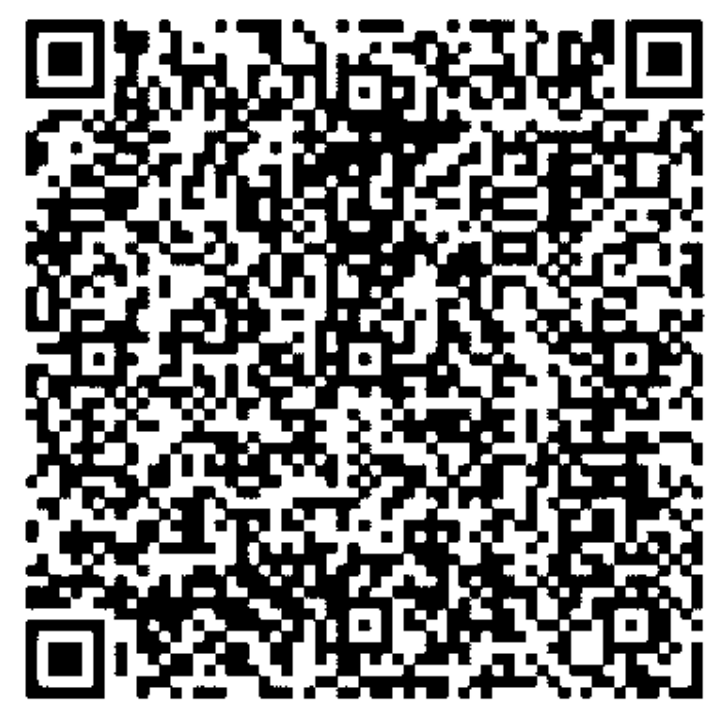
St Mary's Cathedral Main Hall

Note: This method of giving is analogous to putting cash into the offertory bag/box. Your donation will go to the General Fund. You will not be given a receipt. Do not use this to give a pledge.