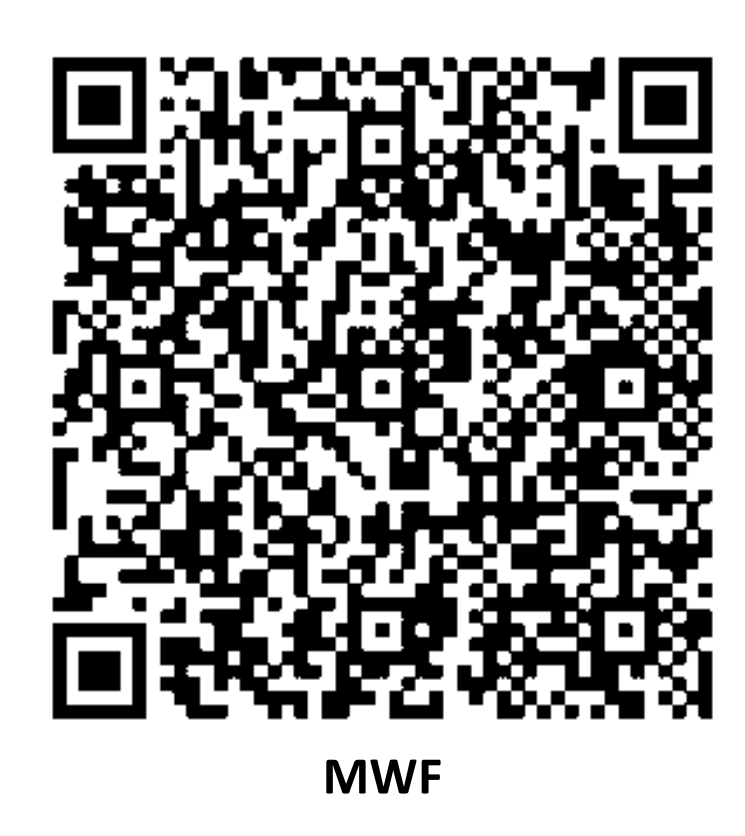
Onsite and Online Services

If you would like to give to the Ministry Workers Fund, please scan the following QR code using any banking or e-wallet app (Touch n Go/GrabPay/Boost). Please ensure "MWF" is listed as the payee.