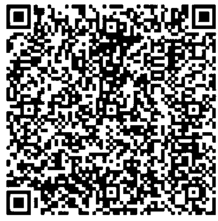
St Mary's Cathedral Main Hall

Note: This method of giving is analogous to putting cash into the offertory bag/box. Your donation will go to the General Fund. You will not be given a receipt. Do not use this to give a pledge.