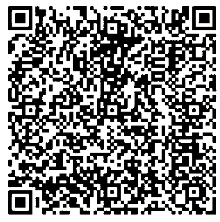
St Mary's Cathedral Main Hall

Note: This method of giving is analogous to putting cash into the offertory bag/box. Your donation will go to the General Fund. You will not be given a receipt. Do not use this to give a pledge.